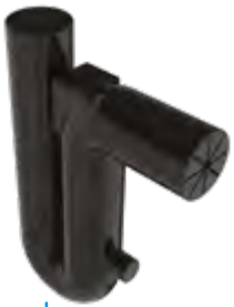
Overflow trap with rodent protection