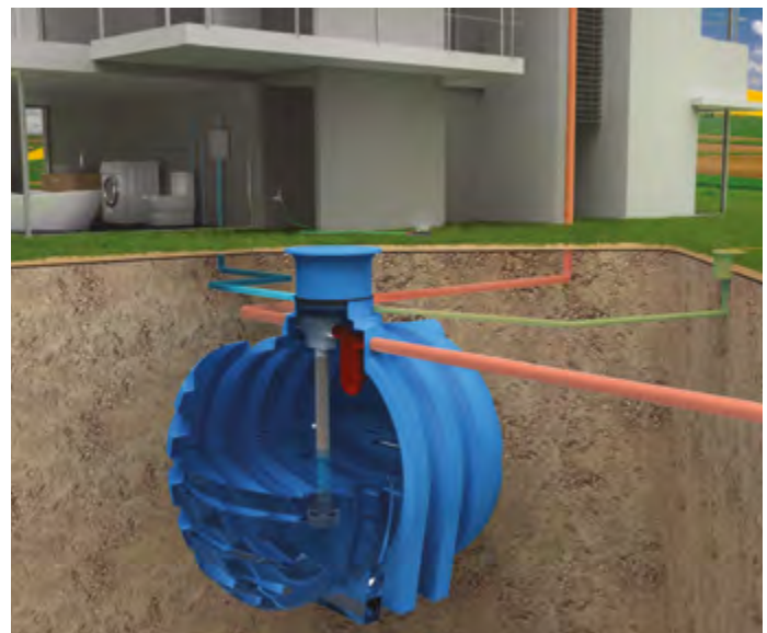
NEPTUN installed with inflow set