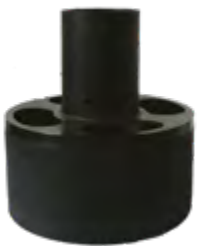
Flow reducer to prevent sedimentation turbulence in the tank