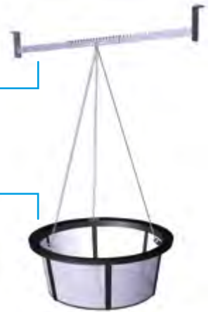
Filter basket with fine screen for suspension in the shaft